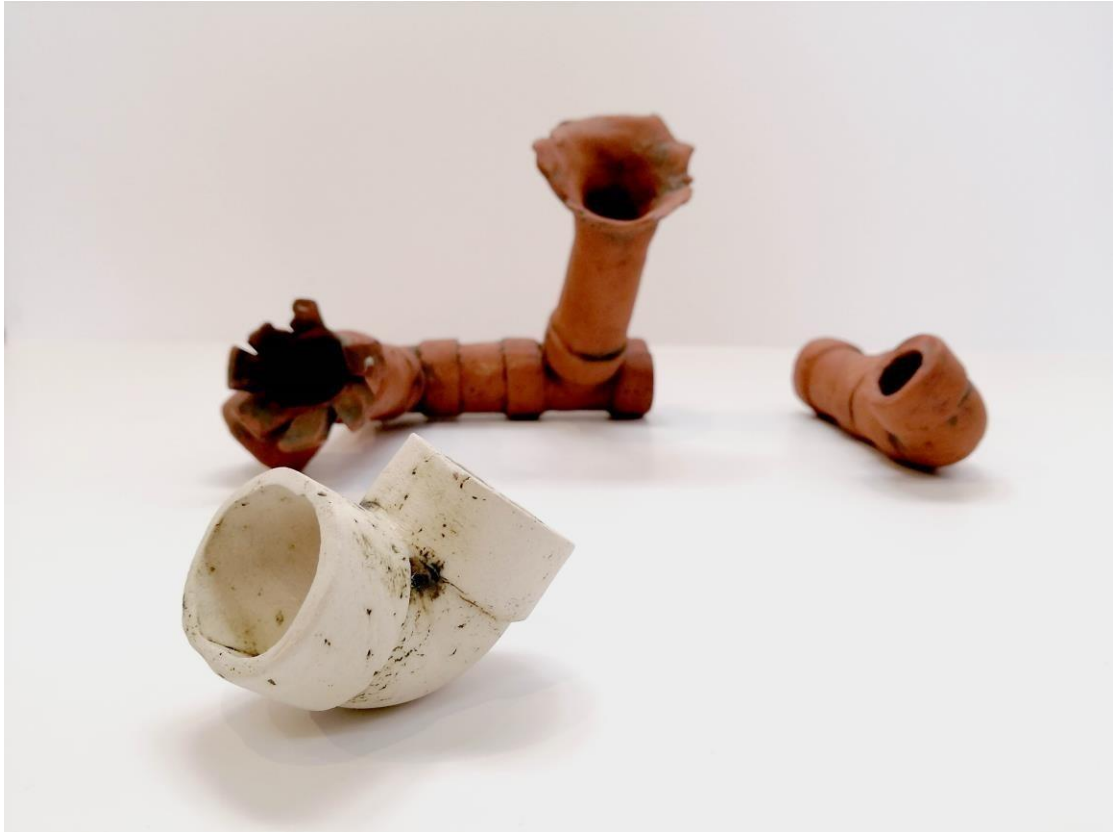
Natalie de Morney Where Next II, 2018 Ceramic 30 x 40 x 15cm