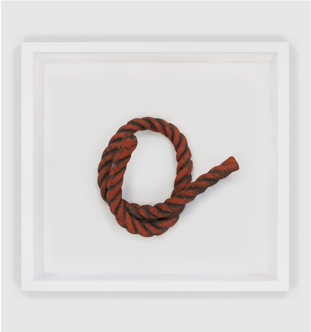
Natalie de Morney Paths linked to community 1 of 3, 2018 Ceramic 45 x 45cm