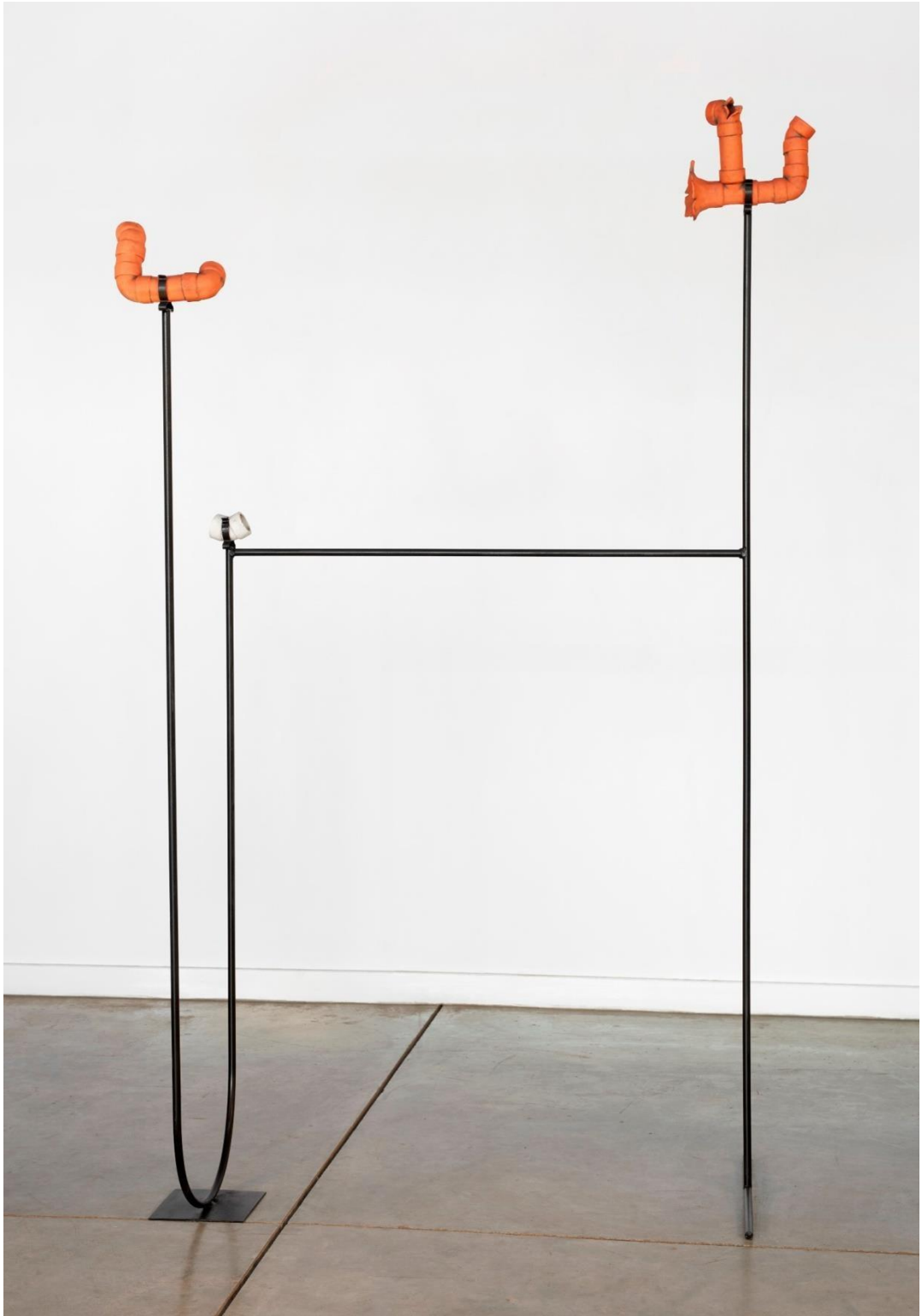
Natalie de Morney Where Next I, 2018 Ceramic 170 x 150 x 100cm