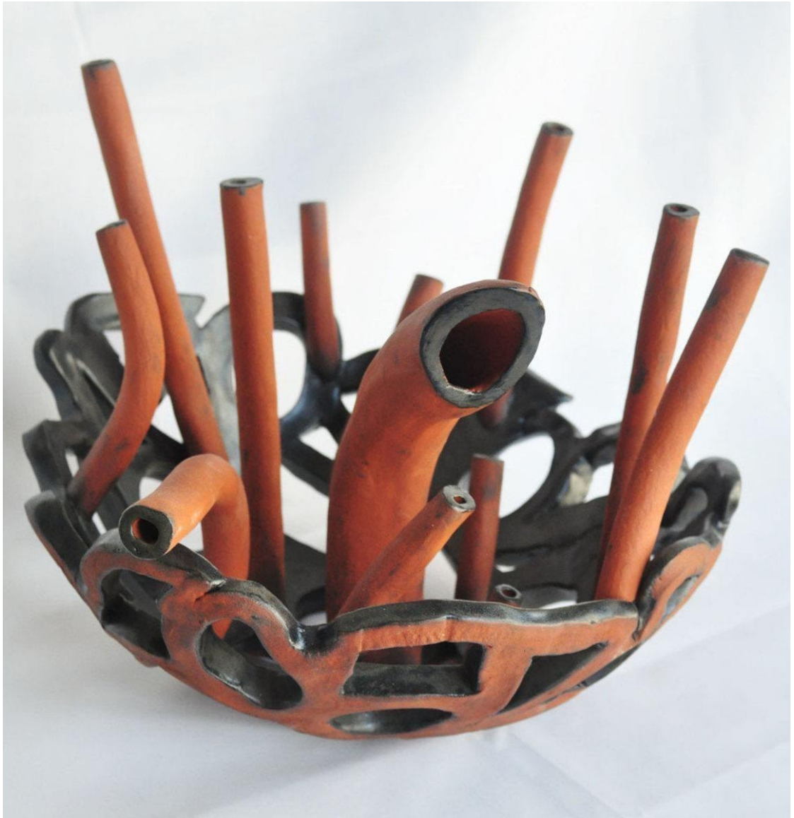
Natalie de Morney Growth and Connection, 2018 Ceramic 25 x 25 x 24cm