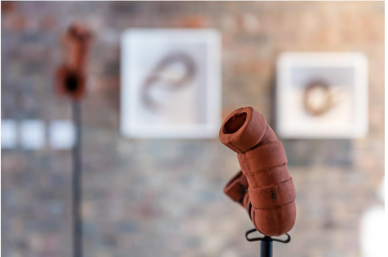
INSTALLATION PHOTOGRAPH