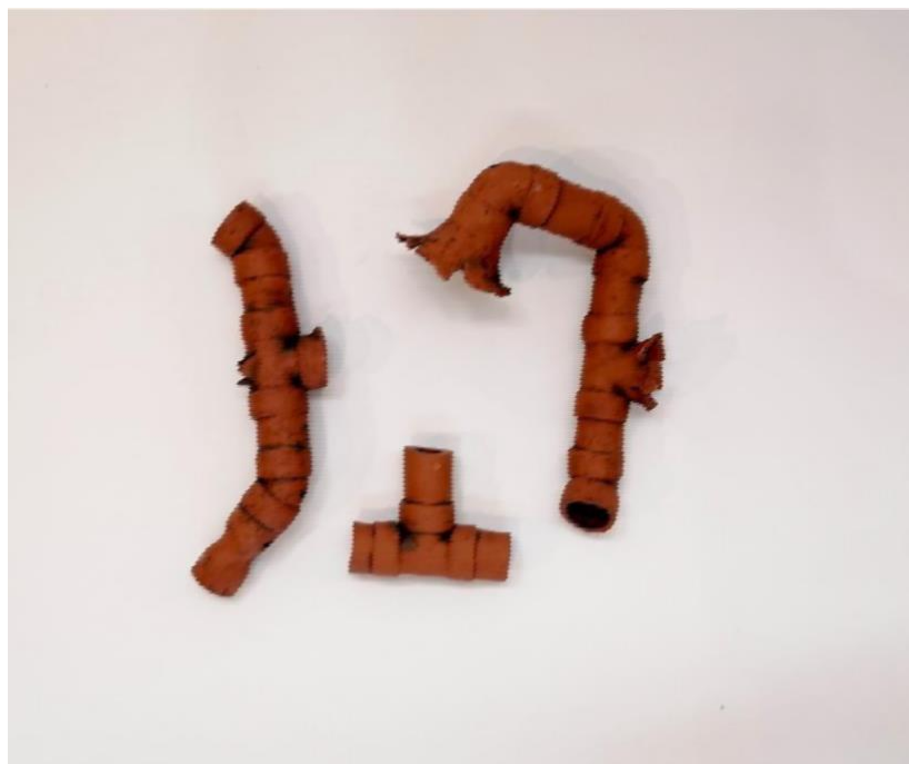
Natalie de Morney Where Next IV, 2018 Ceramic 30 x 50 x 10cm