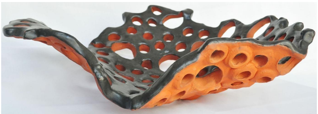
Natalie de Morney Portals III, 2018 Ceramic 37 x 31 x 13cm