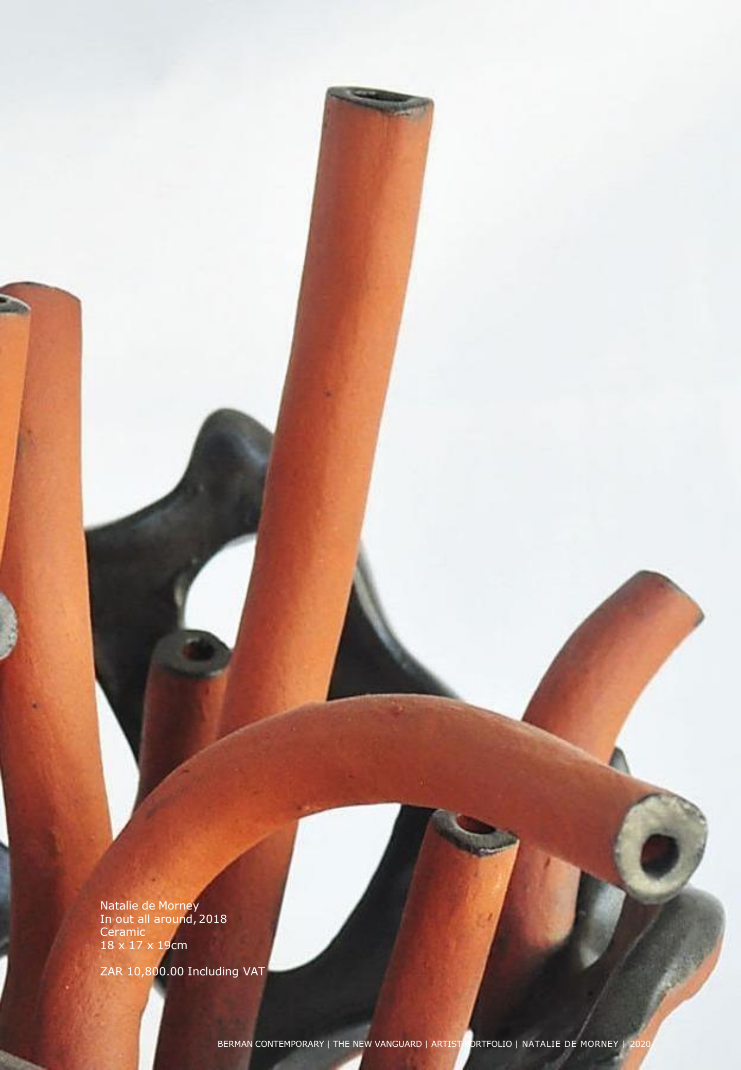
Natalie de Morney In out all around, 2018 Ceramic 18 x 17 x 19cm