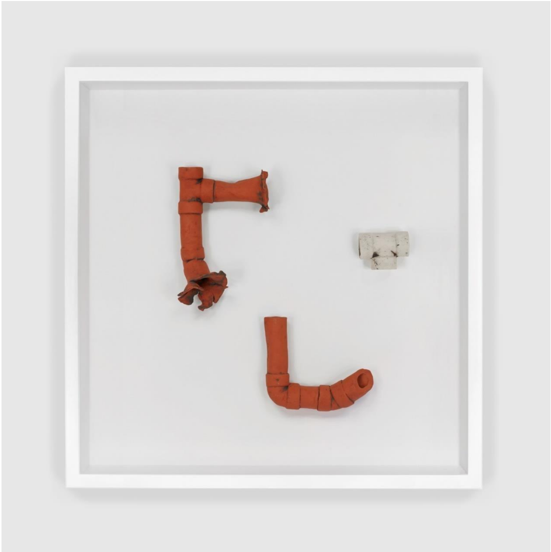
Natalie de Morney Where Next V, 2018 Ceramic Framed Size 63 x 63cm