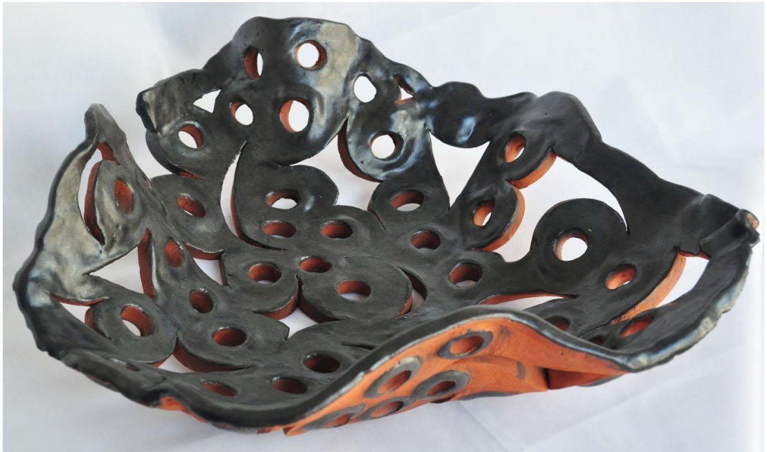
Natalie de Morney Portals I, 2018 Ceramic 37 x 31 x 13cm