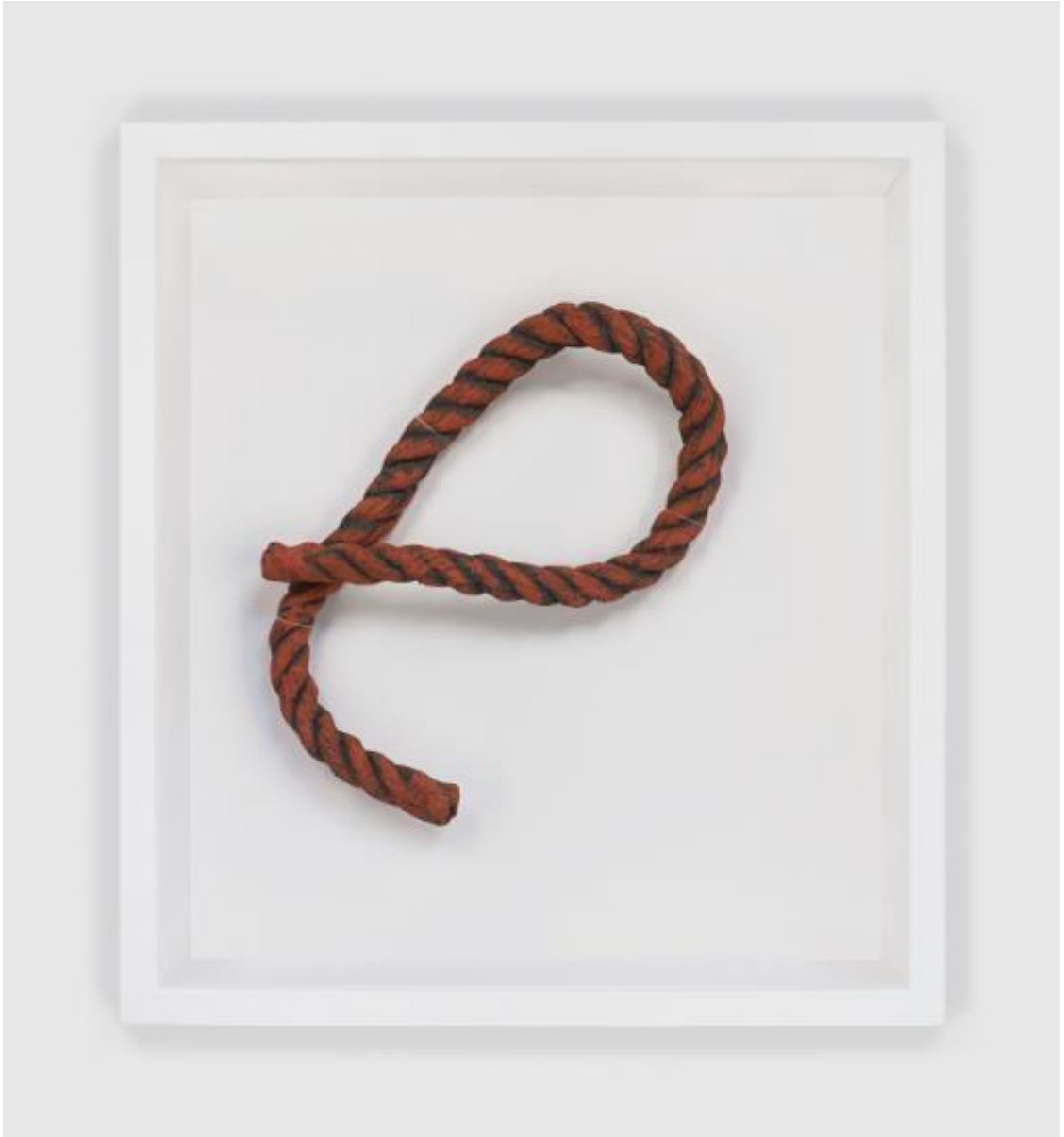
Natalie de Morney Paths linked to community 2 of 3, 2018 Ceramic 52 x 52cm