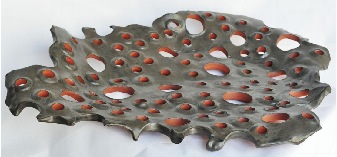
Natalie de Morney Portals III, 2018 Ceramic 64 x 44 x 11cm