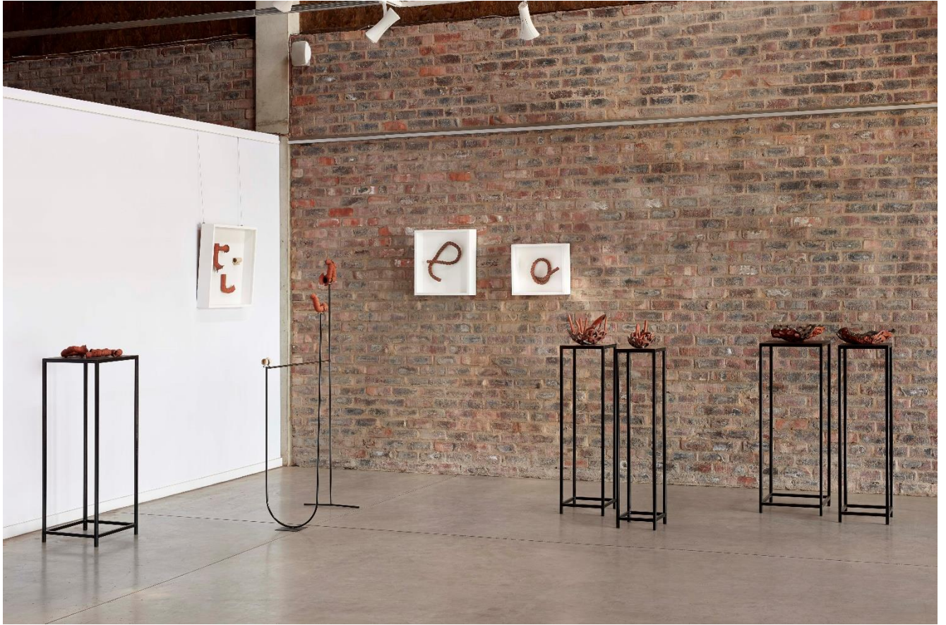
INSTALLATION PHOTOGRAPH | NATALIE DE MORNEY